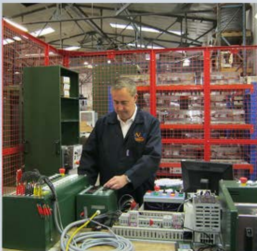
Fully Qualified Test Engineers

In order to guarantee the highest levels of efficiency and reliability of your circuit breakers we recommend regular servicing of you breakers & protection devices to identify potential faults, thus avoiding costly downtime.